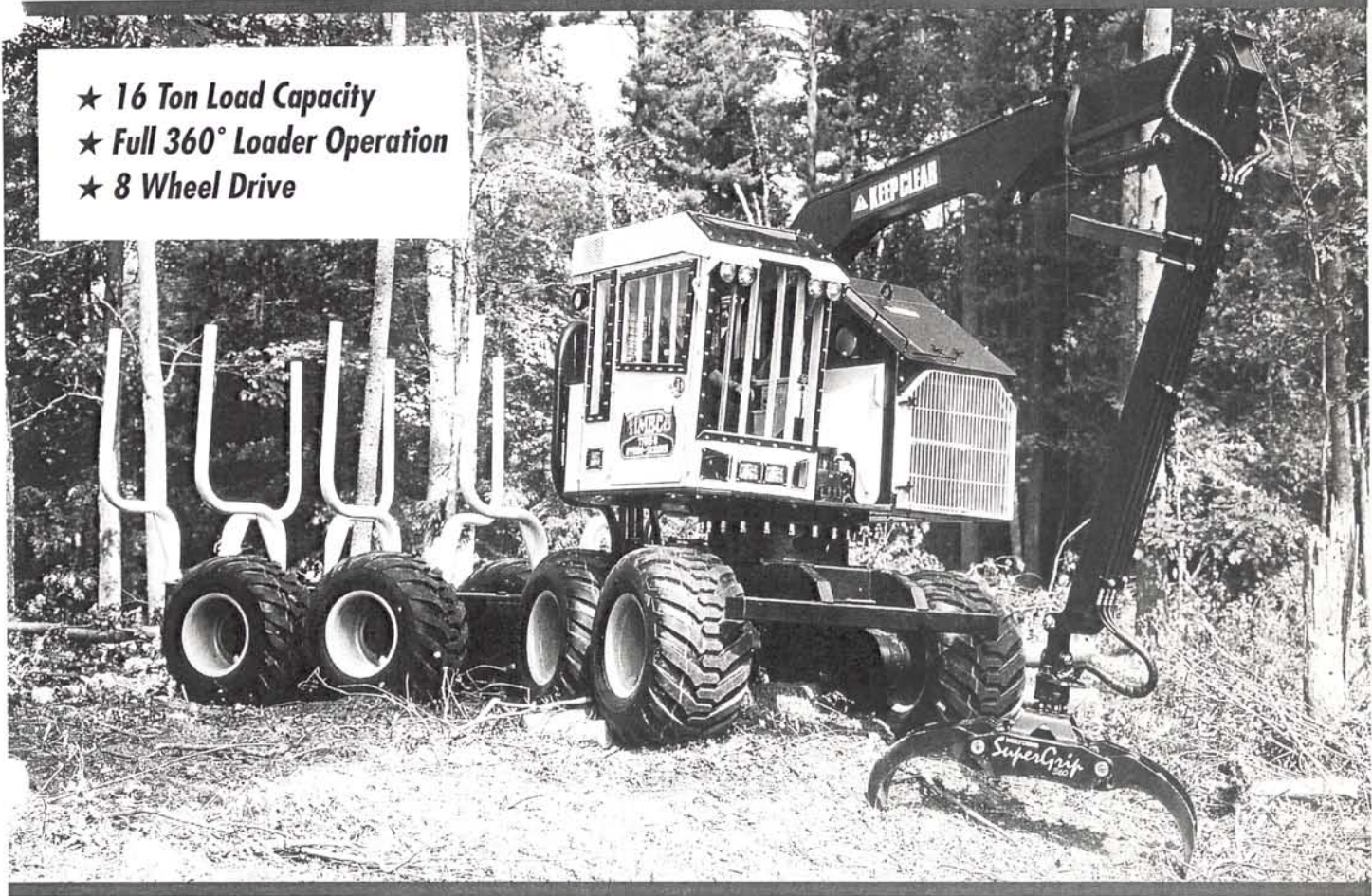
Timbco TF815 shown in Forwarder configuration.